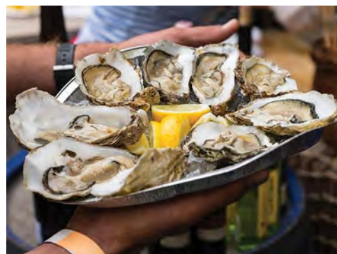
Urbanna Oyster Festival, November 1-2, 2024

No matter where you're located—from the peaceful surroundings of Raphine to the historic streets of Locust Grove—Mark Dana communities share a common thread: a commitment to fostering a warm and inviting environment. We may be spread across the State, but we're one community at heart. Whether you're attending a local festival or simply enjoying time with family and friends, we encourage you to embrace the spirit of togetherness this November.