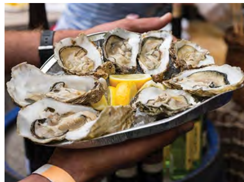
Urbanna Oyster Festival, November 1-2, 2024

No matter where you're located—from the peaceful surroundings of Raphine to the historic streets of Locust Grove—Mark Dana communities share a common thread: a commitment to fostering a warm and inviting environment. We may be spread across the State, but we're one community at heart. Whether you're attending a local festival or simply enjoying time with family and friends, we encourage you to embrace the spirit of togetherness this November.