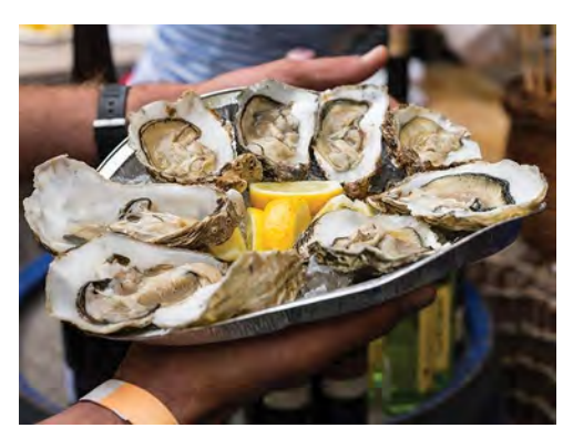
Urbanna Oyster Festival, November 1-2, 2024

For those in Lexington and Aylett, November is the perfect time to volunteer at a local food drive or