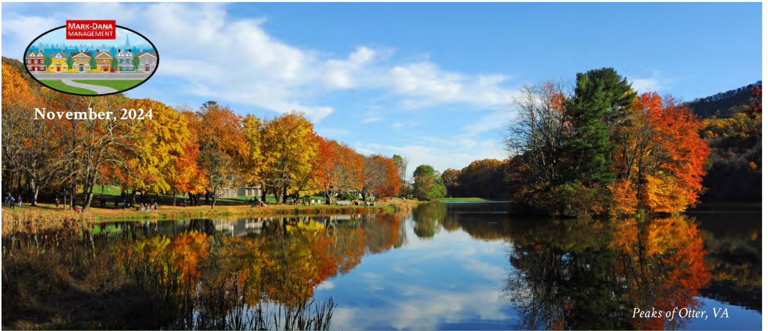
Peaks of Otter, VA